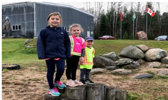
Happy children enjoying our playground!