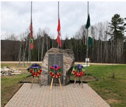
2022 Remembrance Day Memorial

I made an October visit to Bissett Creek to award a certificate of appreciation to sisters for accepting the first ever "Mayor's Pumpkin Challenge." You may ask, "what is the mayor up to now?" At the June Jazaar in late spring, I hosted the Municipal table and offered free pumpkin seeds to any child who would take the challenge and try to grow a beautiful Halloween Pumpkin.